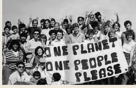
Participants during a peace camp, Penguin Island 1985

The Australian Senate adopted a resolution condemning the persecution of the Bahá'ís in 1981, the first in a long series of parliamentary resolutions on that topic that continue until today. Various Australian Foreign Ministers, State Parliaments, and individual MPs have continued to call for an end to the persecution.