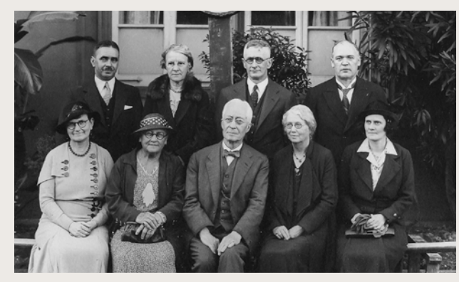
Members of the first National Spiritual Assembly of the Baha'is of Australia and New Zealand, 1934

The early Bahá'í Assemblies or groups held public meetings, printed newsletters, presented the Bahá'í message to public officials, and consulted on the administrative affairs of a growing community.