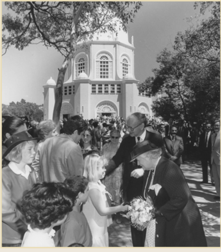
Governor-General of Australia Sir Ninian Stephen and Lady Stephen attend a service at the House of Worship in 1986

The Lord Mayor of Sydney held a reception for international dignitaries present for the dedication, and press coverage was considerable.