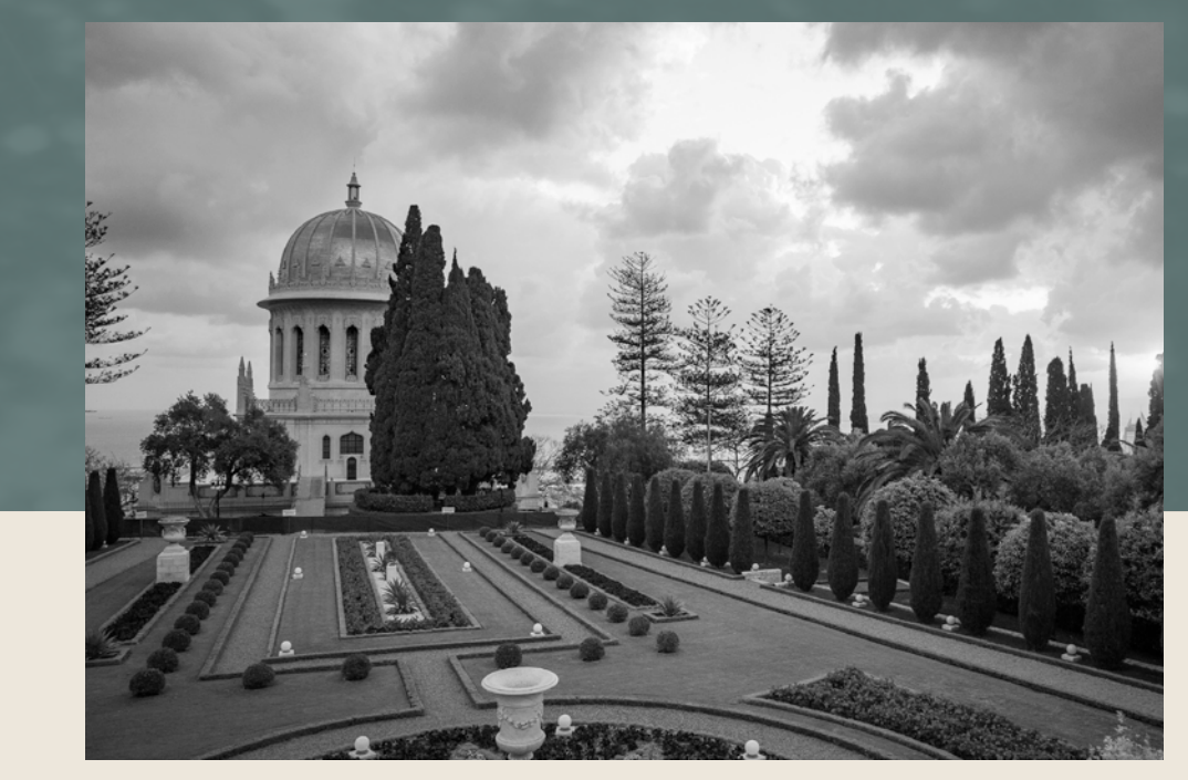
The Shrine of the Báb. Mount Carmel, Haifa, Israel.

(Message to an event marking the anniversary of the Birth of Bahá'u'lláh and the Bicentenary of the Birth of the Báb, October 2019).