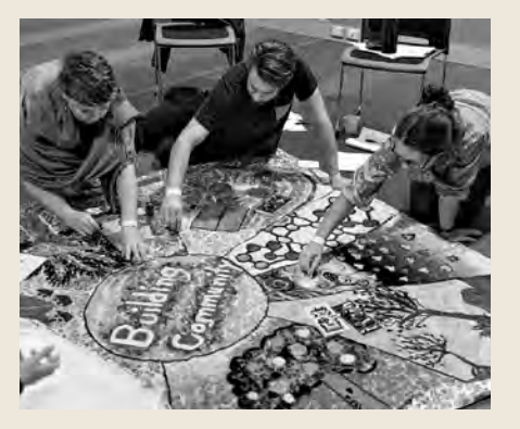
Participants in a major youth conference held in Brisbane in 2013 prepare an artwork about community building.

Since the 1990s, the introduction of a training institute, popularly known as the Ruhi Institute, has provided a