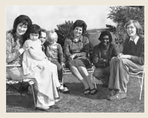
Bahá'ís and friends in Warrnambool, Victoria, 1970s

The Australian Bahá'í community has sought over the past century to live up to the Bahá'í ideal of unity in diversity. Today the community comprises members from all parts of the globe, including European, Asian, African, North and South American, and Pacific Island nations.